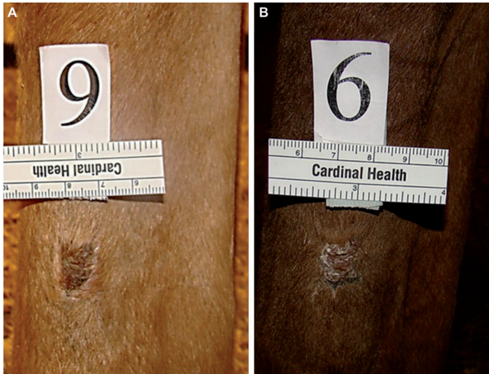
Figure 4 Appearance of (A) control and (B) laser-treated wounds at day 80.

[10]. A significant clinical observation was the absence of exuberant granulation tissue in the laser-treated wounds. The wound margins of the laser-treated wounds contracted and epithelialized and the overall contour of the wounds